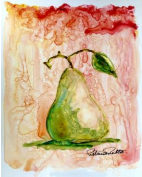
By Pat Pelletier